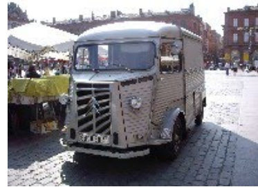
Actually any old Citroen would do