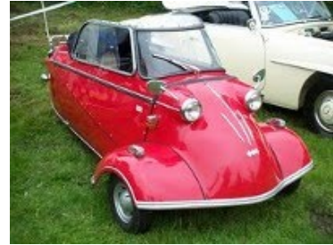
The world's most iconic microcar