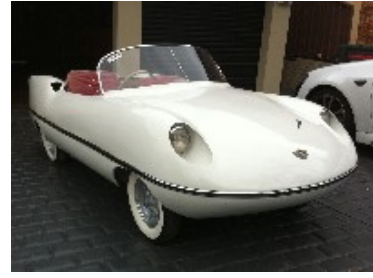
"Not the Dart. They always think it's the Dart!"