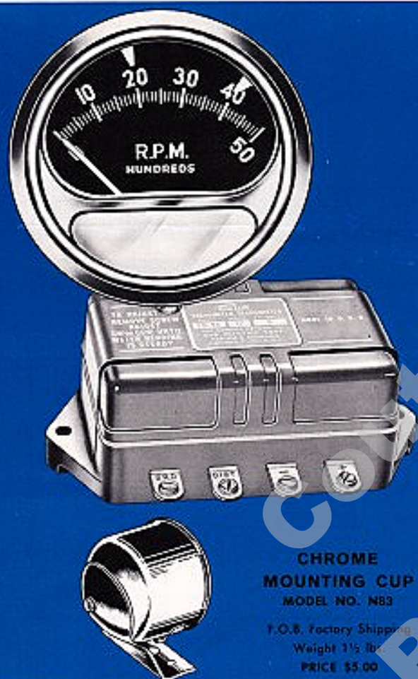
CHROME MOUNTING CUP MODEL NO. N83

Built up to Quality . . . not down to Price!