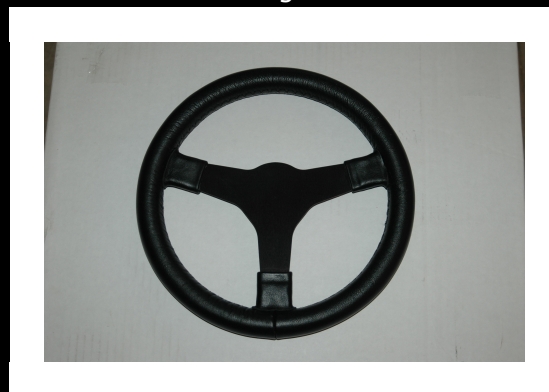
Another example of our products.

We take an enormous pride in creating our products, and hope that you'll find something in our catalog that you like. We also can create custom orders; call or email and let us know what you want.